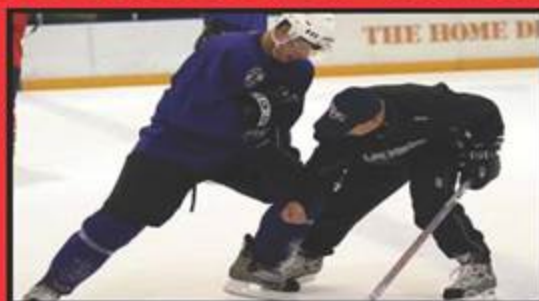
ABOVE: TEACHING NHL SUPERSTAR SIDNEY CROSBY

HURRY & SIGN-UP...THIS PROGRAM STARTS SOON! SKATING COACH TO THE NHL STARS!!!